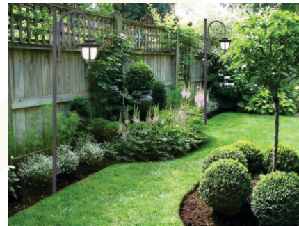
Square & Pedestrian Area, Heritage Buildings & Street, Hotels, Residential Areas etc.